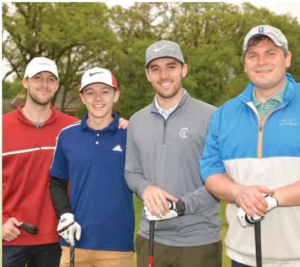
Enjoying a day on the course.