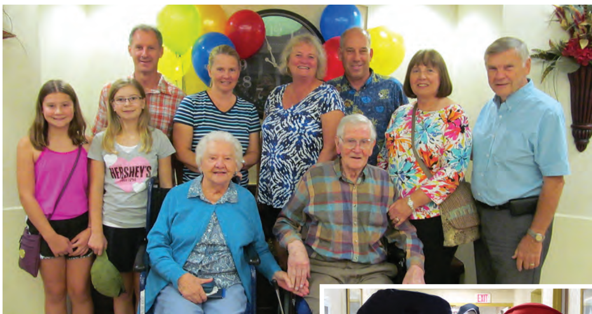
Families enjoyed the beautiful gardens with a day full of activities for all ages!

May 22, 2017 St. Patrick's Annual Benefit Golf Outing (Stonebridge Country Club)