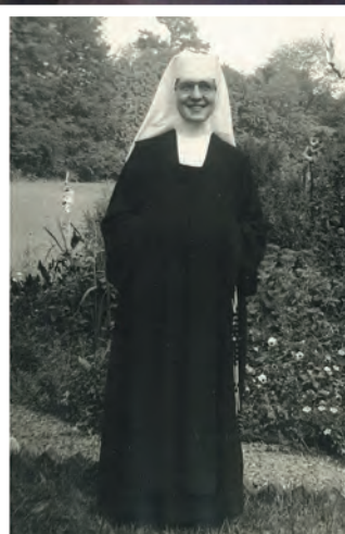
(Top) "Hot Rod" makes her rounds in the Emerald Garden