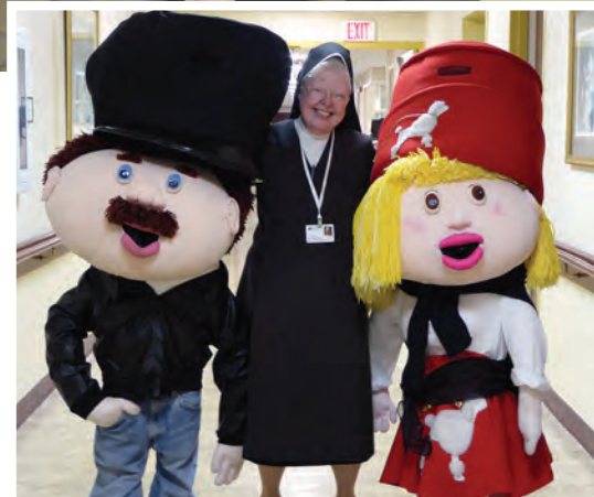
Those Funny Little People entertained throughout the House.