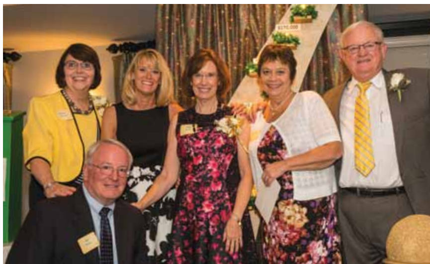
2017 GOLD KEY COMMITTEE

We've been blessed to co-sponsor the Gold Key Gala with The Guild of St. Patrick's for 14 years. The proceeds from the Gold Key Gala play a critical role in allowing St. Patrick's Residence to enhance our services and make facility improvements.