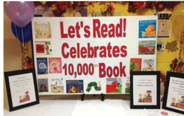
The staff of St. Patrick's wishes to thank the Miller Family for their gift to us and to the children in our lives.