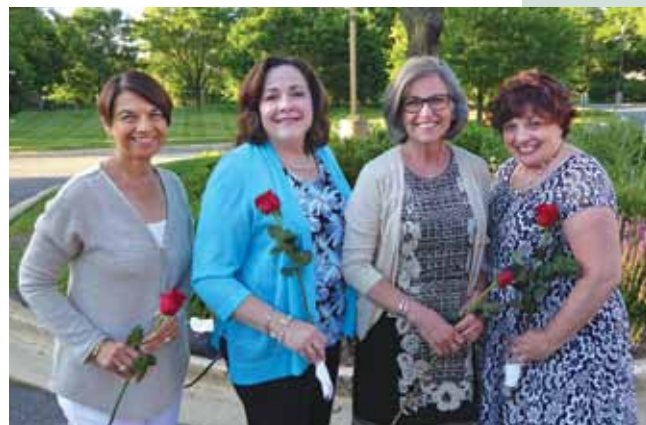
2017-2018 EXECUTIVE BOARD