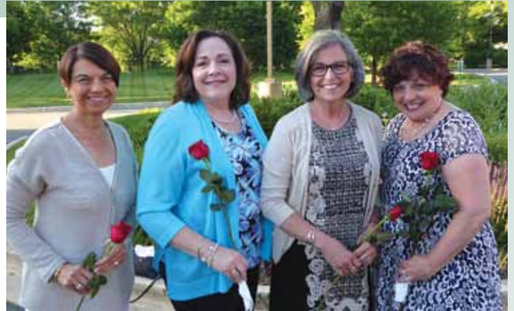
2017-2019 Executive Board

We thank the many Guild Members who have served St. Patrick's Residence over the years for all of the time, talent and fundraising they have dedicated to St. Patrick's.