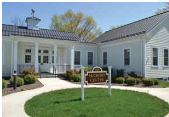
Located in the Hudson Valley Region of New York, on the grounds of the Motherhouse of the Carmelite Sisters, the McCrory Center is the headquarters for the Carmelite System. Opened in 2010, the McCrory Center provides the Carmelite System with additional resources to better serve our residents and facilities.

There are currently over 150 Carmelite Sisters living and serving in the Homes. Each home sponsored by the Carmelite Sisters follows the four core values of compassion, hospitality, shared commitment and sanctity of life. The Sisters live in Convents attached to the Homes and together with their dedicated staff serve the residents with love, respect and dignity.